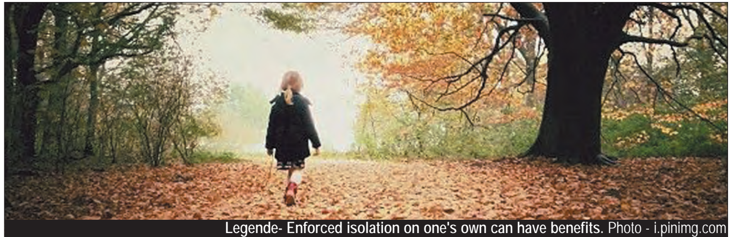
Legende- Enforced isolation on one's own can have benefits.

Advocates of solitude hence stress how, with fewer preoccupations, we can reconnect to aspects of ourselves we usually don't have time for. This may not always be pleasant. But periodically reassessing who we are, even when it throws up confronting desires, harrowing fears or humbling insights, may be renewing.