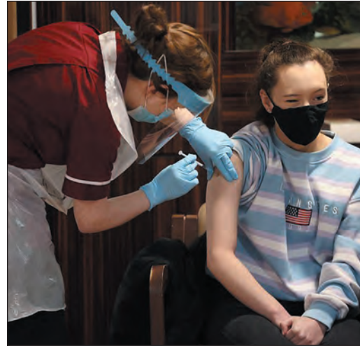
Care home staff receive the Pfizer/BioNtech Covid-19 vaccine at Bradley Manor residential care home in Belfast

They suffered an 'anaphylactoid reaction' to the vaccine, which is milder than anaphylaxis, and tends to involve a rash, shortness of breath, swelling of the face