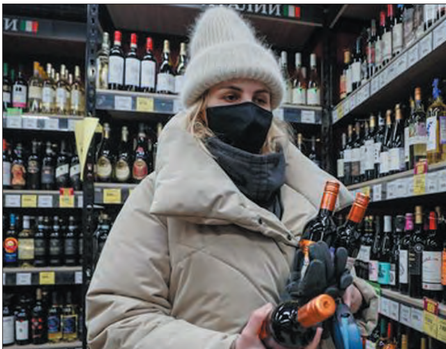
Russians have been advised to go easy on the drinks if they're getting jabbed.