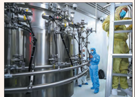
In this April 11, 2020, photo, staff members check and clean equipments at a vaccine production plant of SinoPharm in Beijing.

China currently has five coronavirus candidates from four companies which have reached phase 3 clinical trials, the last and most important step of testing before regulatory approval is sought.