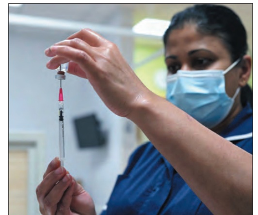
A nurse at the Royal Free Hospital in London simulates the administration of the Pfizer vaccine on Dec. 4, 2020 to support staff training ahead of the rollout in the United Kingdom.

If enough people are vaccinated, the level of indirect protection in a population can be high. And indirect protection can be very powerful. Had it not been for indirect protection, smallpox would never have been globally eradicated in 1977. Once a sufficient number