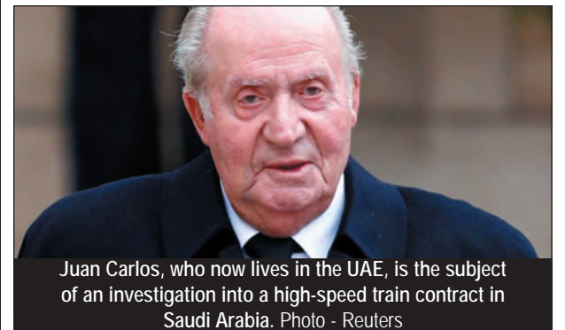
Juan Carlos, who now lives in the UAE, is the subject of an investigation into a high-speed train contract in Saudi Arabia.

Spain's former king Juan Carlos, who left his homeland under a cloud of scandal in August, has settled a back tax bill worth over 678,000 (£611,388) including interest and fines, his lawyers said on Wednesday.