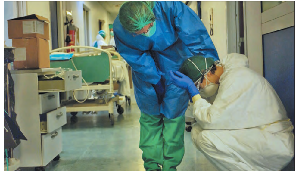
Nearly 7000 health professionals have lost their lives so far, and this is an underestimate. They died while trying to save others.

Which makes one wonder what keeps the world ticking somehow? It must be the hundreds of millions who go on toiling nevertheless, preferring to do their day's work with sincerity and honesty, even if motivated only by the need to cater for their families. But there are as many millions of others who see a higher purpose in their calling, and view their efforts as the contribution they need to make so as to leave the world a better place for their children and the future generations.