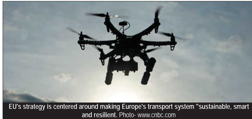
EU's strategy is centered around making Europe's transport system "sustainable, smart and resilient.

By 2030, aims for the strategy include: at least 30 million zero-emission cars on the road; "market-ready" zero-emission marine vessels; and the large-scale deployment of automated mobility. Other targets for the next decade include the