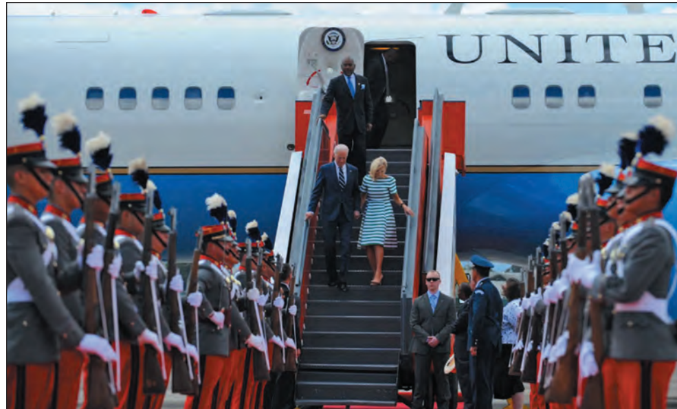
Joe Biden and his wife, Jill Biden, arrive at the Guatemalan air force base in Guatemala City on March 2, 2015.

“With each country seeing the other's economic system as incompatible with its own, Russia and the U.S. never stopped to imagine where they might cooperate. The time has come to change our approach and rebuild our relationship with Russia and use the lessons of the past not to make the same mistake with China. It is not difficult to see that America has little to gain from continuing conflict with Russia and perhaps little to lose as well but the ongoing distraction caused by Russia's nagging presence on the world scene invades bandwidth needed to deal with other more pressing problems...”