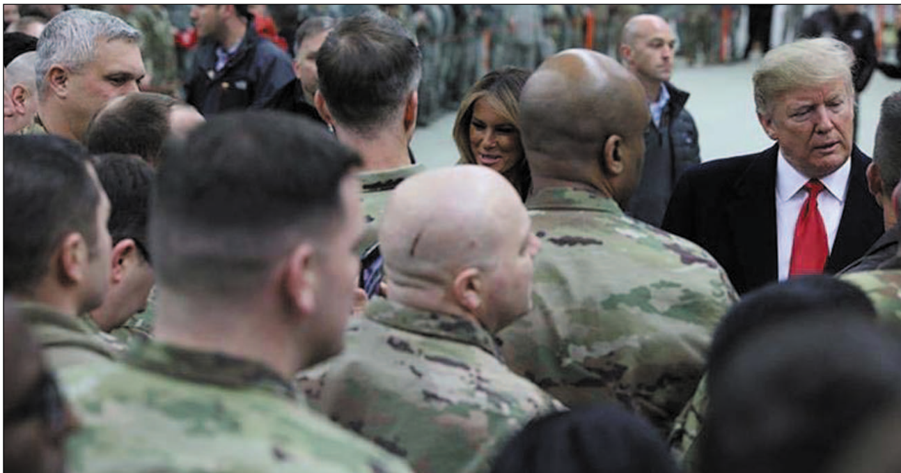
Germany currently hosts by far the largest number of US forces in Europe.

The US is set to withdraw almost 12,000 troops from Germany in what it described as a "strategic" repositioning of its forces in Europe.