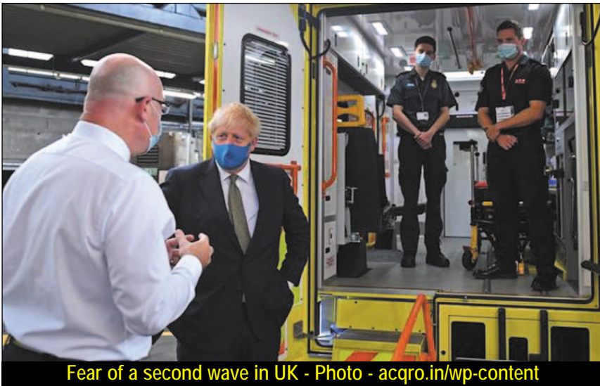
Fear of a second wave in UK

The UK government is not doing everything it should to stop a second wave of coronavirus from hitting the country, the British Medical Association's top doctor has warned. The intervention comes as Boris Johnson pointed the finger at Europe and said "swift" action was being taken to prevent localised outbreaks identified on the continent spreading